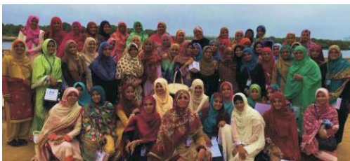
Thank You Teachers for making Montessori successful at FMS

Another milestone achieved is the introduction of our own published books for FMS 1 and 2. These books are specifically designed for cursive writing. The book for FMS 3 is under print.